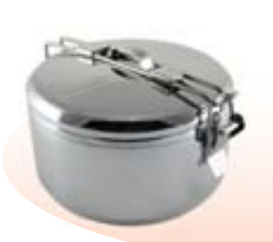
A-TIF1-14 FOOD CONTAINER/POT 10cm h. X 14cm di. (4 in. h. X 5 1/2 in. di.) Weight: 0.34 kg (12 oz.) Volume: 750 ml (1 quart)