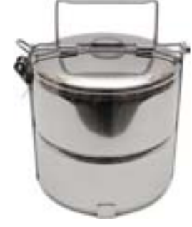
A-TIF2-14 2-TIER TIFFIN 19cm X 15cm dia. (7 1/2 in. X 6 in. dia.) Weight: 0.70 kg (24.7 oz.)