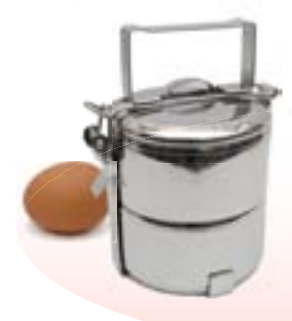
C-TIF-10 MINI TIFFIN 16cm X 10cm dia. (6 1/4 in. X 4 in. dia.) Weight: 0.43kg (15 oz).