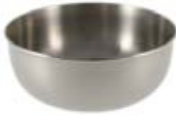
A-SS-BOWL-14 STAINLESS STEEL BOWL 5.5cm X 14cm dia. Volume: 750ml Weight: 0.15kg