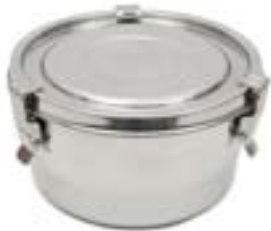
A-SSFC-AR12 ROUND AIRTIGHT FOOD CONTAINER 7.5cm X 12cm dia. Weight: 0.23kg Volume: 710 ml