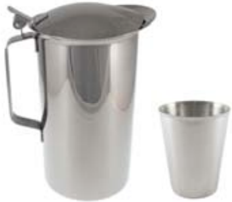
A-SS-JUG-11 STAINLESS STEEL WATER JUG 22cm X 11cm dia. Volume: 1.9L Weight: 0.67kg