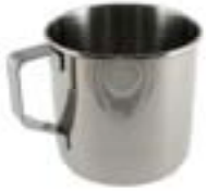
A-SS-MUG-8 STAINLESS STEEL MUG 8cm X 8cm dia. Volume: 400ml Weight: 0.14kg