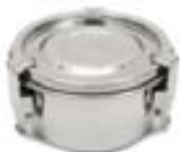
A-SSFC-AR8 ROUND AIRTIGHT FOOD CONTAINER 5.5cm X 8cm dia. Weight: 0.14kg Volume: 240 ml