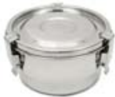
A-SSFC-AR10 ROUND AIRTIGHT FOOD CONTAINER 6.5cm X 10cm dia. Weight: 0.18kg Volume: 430 ml