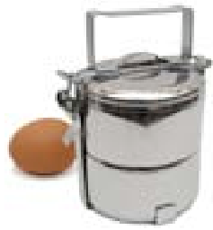
C-TIF2-10 MINI TIFFIN 16cm X 10cm dia. Weight: 0.43kg