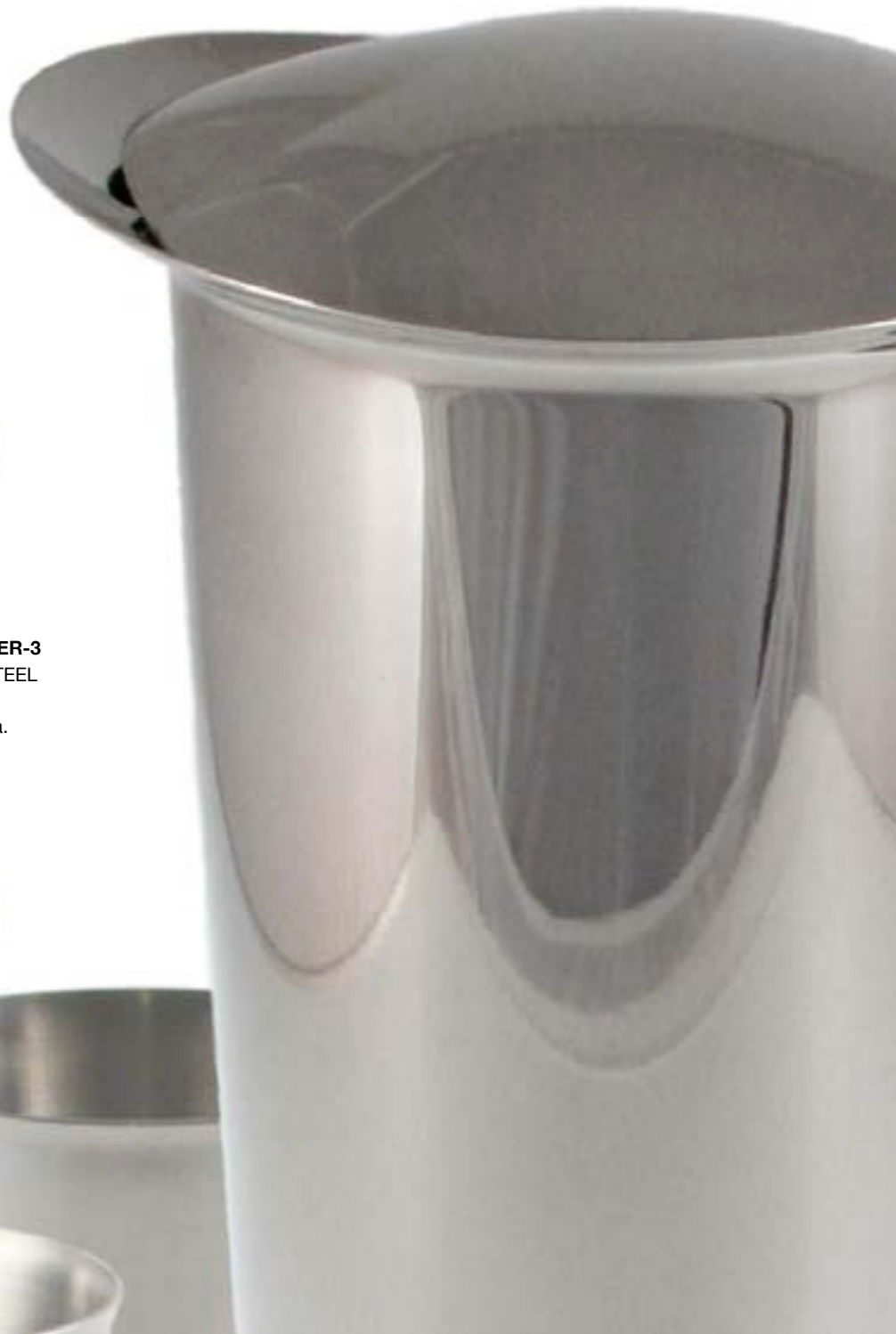
A-SS-TUMBLER-3 STAINLESS STEEL TUMBLER 9cm X 7cm dia. Volume: 250ml Weight: 0.9kg