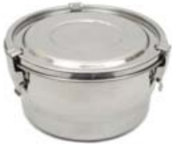
A-SSFC-AR14 ROUND AIRTIGHT FOOD CONTAINER 8.5cm X 14cm dia. Weight: 0.29kg Volume: 1125 ml